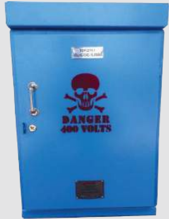
LT SERVICE BOX