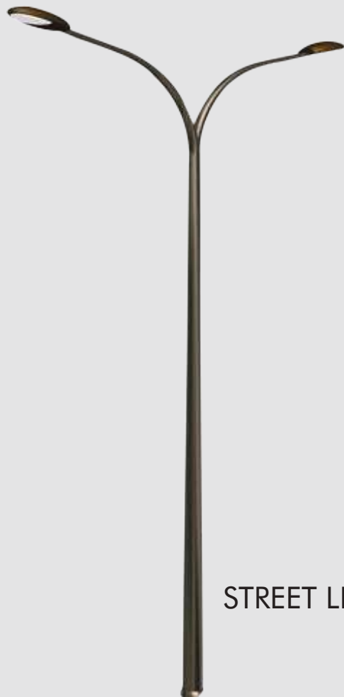
STREET LIGHT POLES